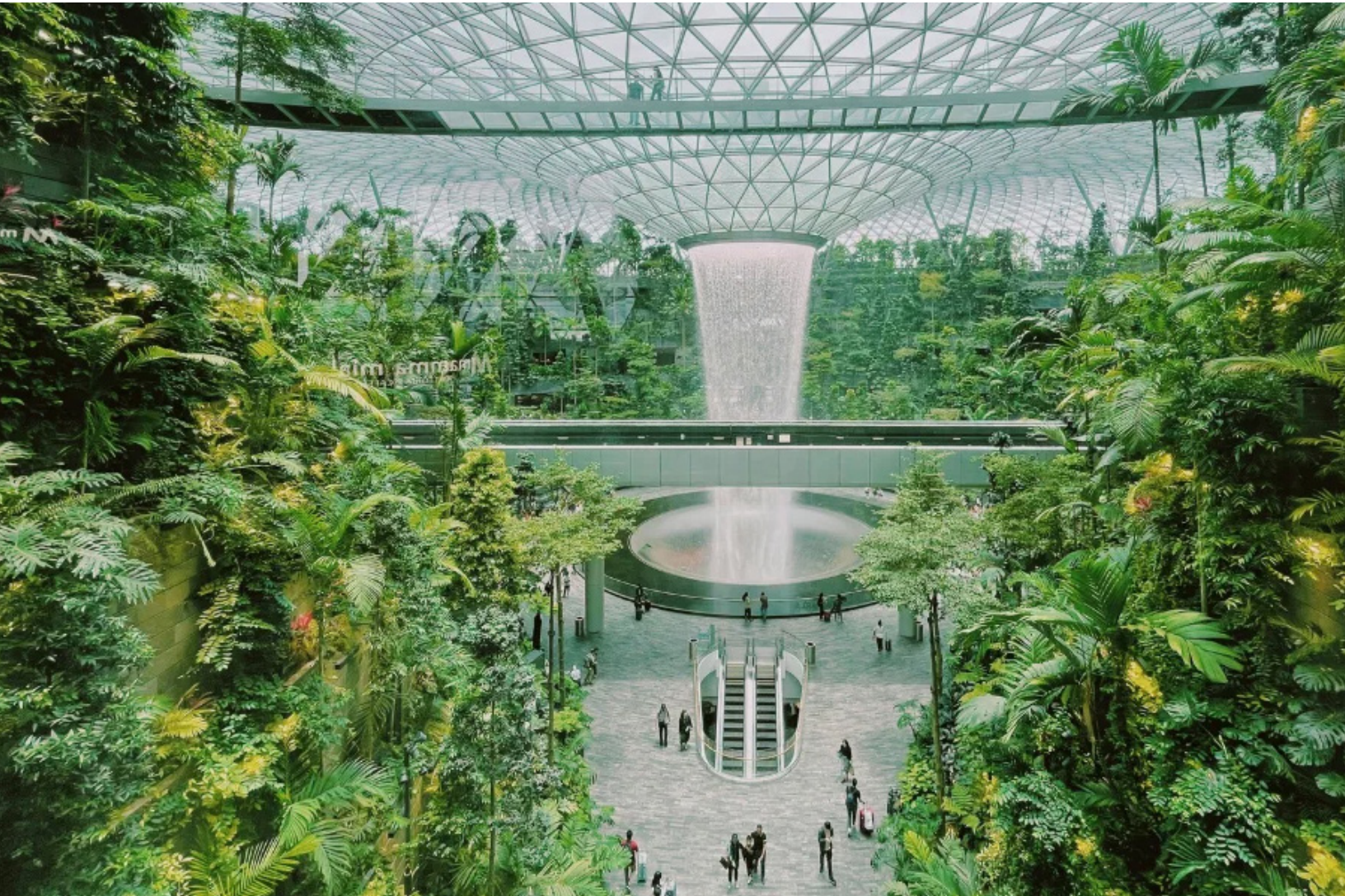
Jewel Changi Airport, Singapore