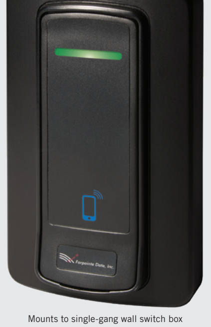
Mounts to mullion

Conekt Mobile Smartphone Access Control Solution